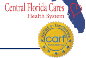
Exhibit F1 - ME Schedule of Funds Central Florida Cares Health System - Contract# GHME1 FY 2021-22 Use Designation - As of 7/01/2021